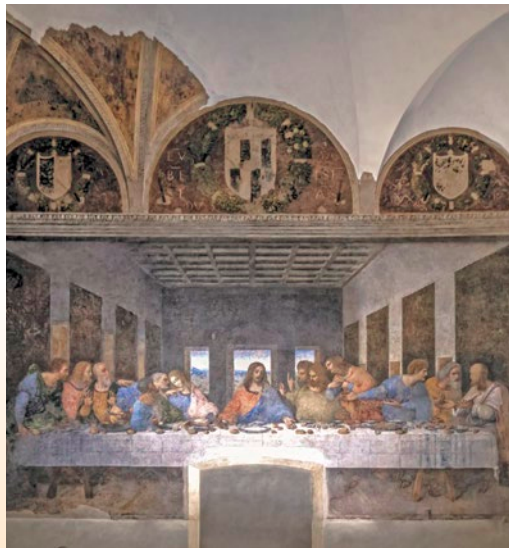
Leonardo da Vinci's "The Last Supper"