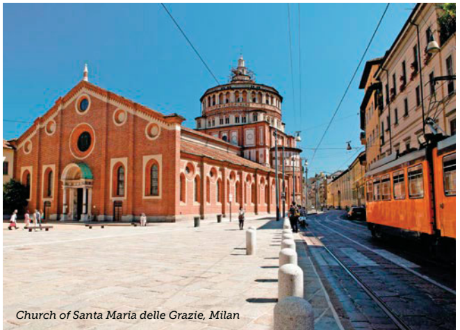
Church of Santa Maria delle Grazie, Milan