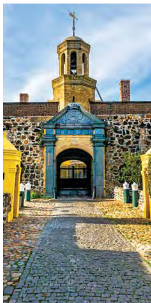
Castle of Good Hope, Cape Town

Knowledgeable Lecturers deepen your appreciation for the region and its history, culture and current events.