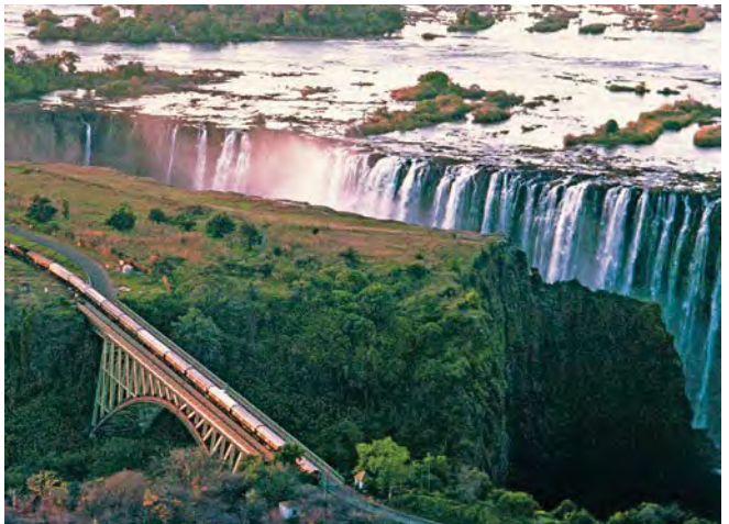
Rovos Rail, Victoria Falls