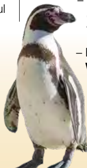
African penguin, Boulder Beach Cape Peninsula