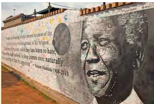
Nelson Mandela mural, Soweto