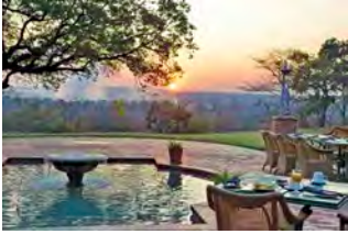
The Victoria Falls Hotel | Victoria Falls