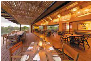
Kapama River Lodge | Kapama Private Game Reserve