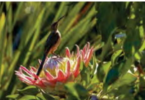
King protea, Cape Floral Region