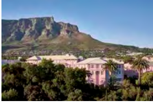
Belmond Mount Nelson Hotel | Cape Town