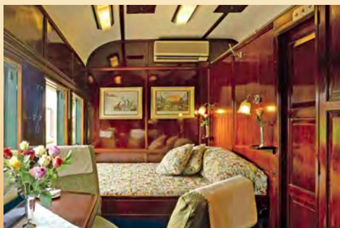
Deluxe Suite with a double bed and a lounge area

Discover the glamorous Golden Age of train travel aboard the luxurious Rovos Rail. Revel in the incredible attention to detail and lavish offerings while riding in vintage carriages, restored to mint condition and impeccably appointed. Spend your days in the Observation Car or mingle with your fellow travelers in the lounge. On-board chefs prepare traditional dishes and regional specialties with only the finest of ingredients. Enjoy sumptuous breakfasts each morning and delicious three-course lunches and dinners, featuring fine South African wines.