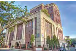
54 on Bath | Johannesburg