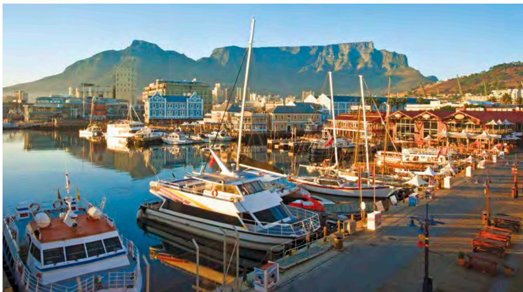
Victoria &amp; Alfred Waterfront, Cape Town