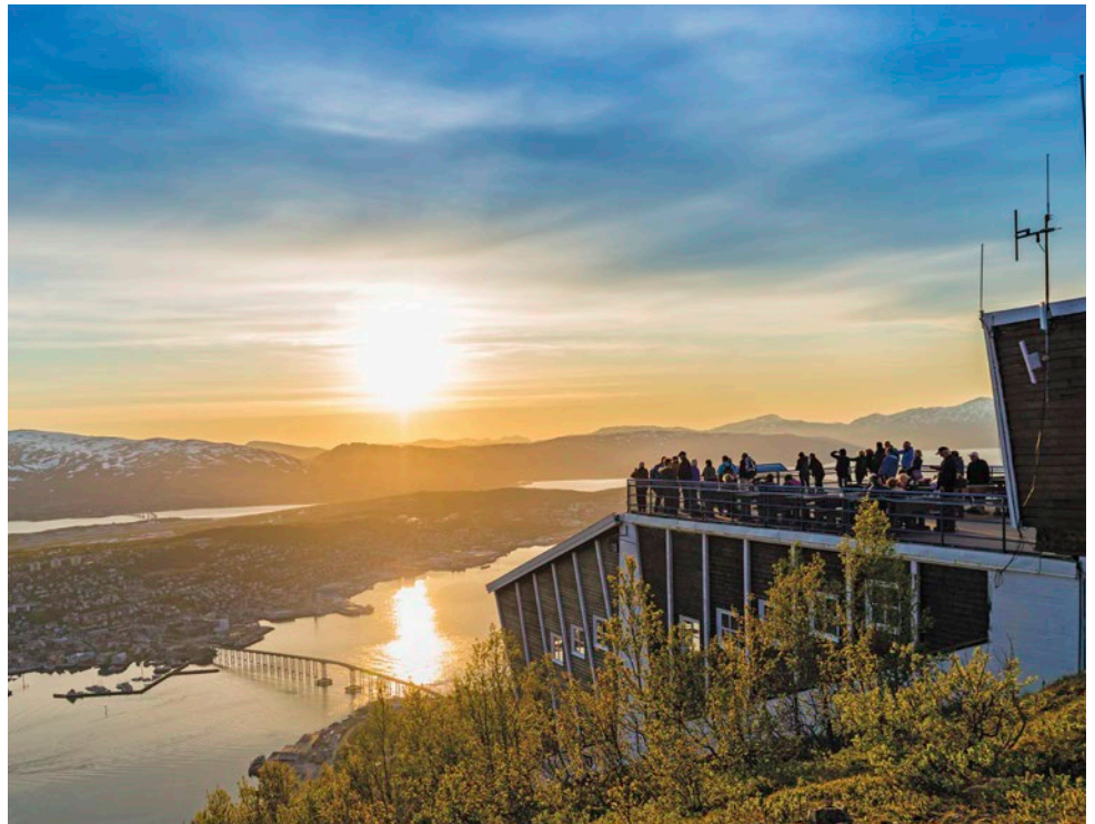
Midnight Sun in Tromsø

Sommarøy Island. Revel in majestic natural beauty on a visit to the village of Sommarøy and learn about the fishing industry there.