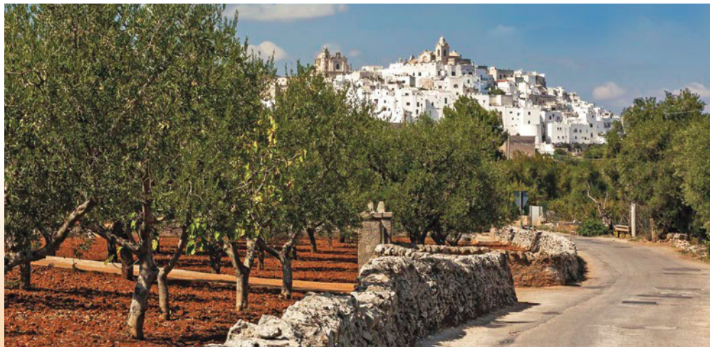
Ostuni, "The White City"

AHI Connects | Olive Mill Outing. Visit a family-run olive mill in the sun-baked countryside. Learn about the history and cultivation process of olives. Unwind over lunch and gather with the mill's employees or owners to discuss life in Italy.