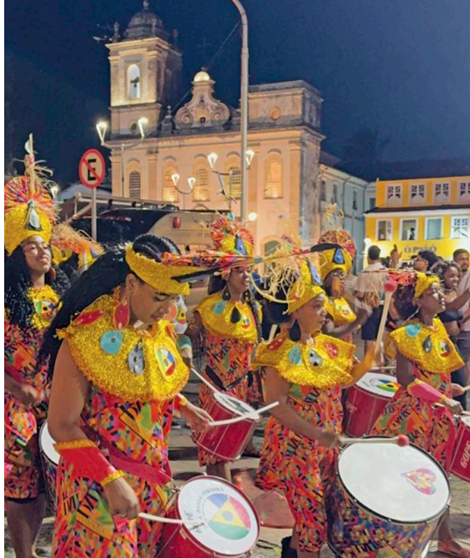
Terça da Benço, Salvador