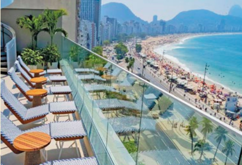
Grand Mercure Rio de Janeiro Copacabana | Rio de Janeiro