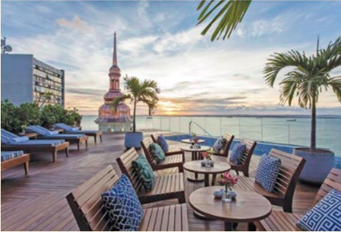
Fera Palace Hotel | Salvador

Our experts have carefully selected these hotels for their prime locations and amenities. In Rio de Janeiro, the first-class Grand Mercure is near the city's landmarks and just steps away from iconic Copacabana beach. The deluxe Fera Palace is in the heart of Salvador. Its authentic art deco styling with modern flourishes welcome guests to the public areas. Enjoy friendly service and inviting, well-appointed guest rooms at both hotels. Complimentary Wi-Fi also is available.