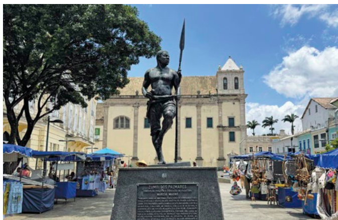
Above: Zumbi dos Palmares monument, Salvador | Below: Santa Teresa, Rio