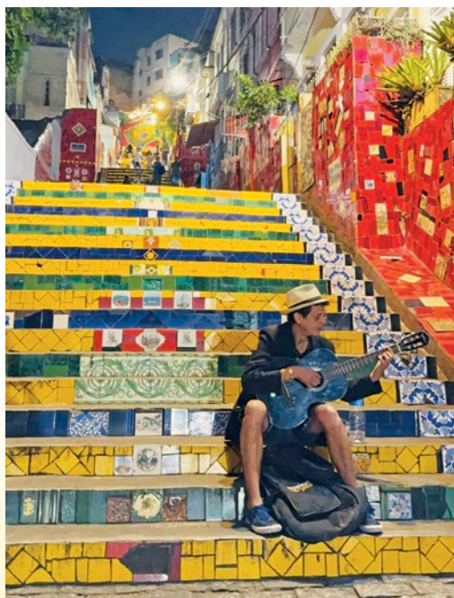
Escadaria Selarón, Rio