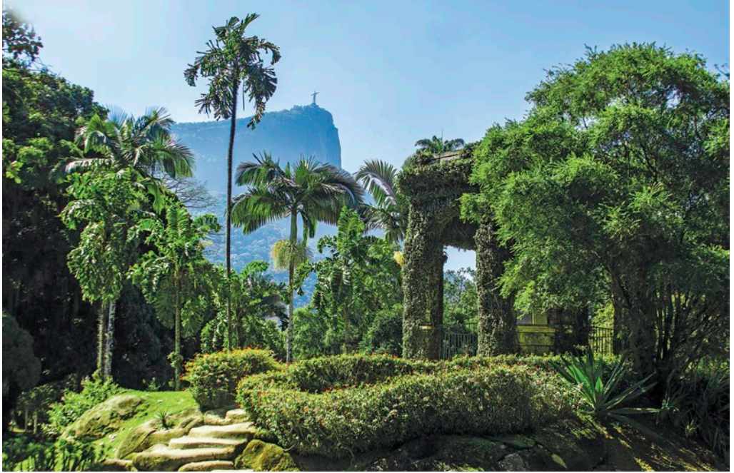
Botanical Garden of Rio de Janeiro