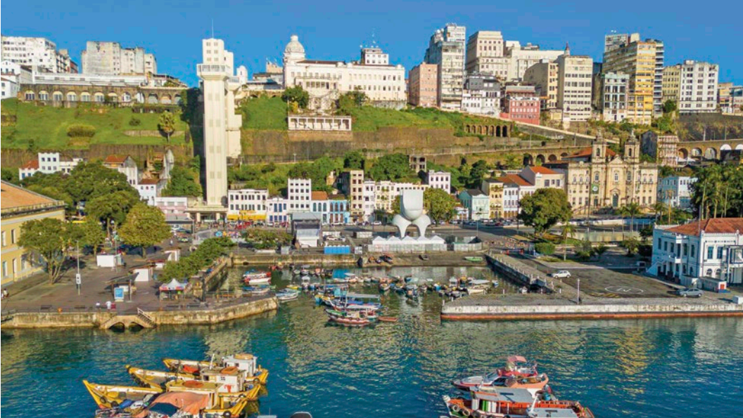
Upper and lower towns of Salvador

Free Time: Enjoy time to explore on your own. Join a festive group dinner in Santa Teresa.