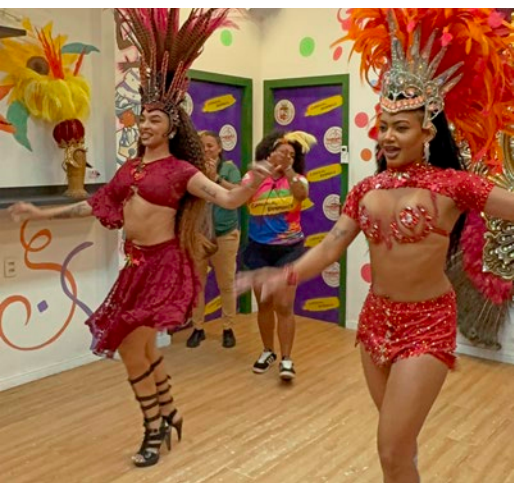
Samba school, Rio

Free Time: Enjoy an afternoon at leisure.