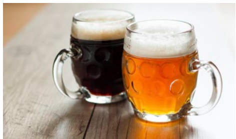
Top: Charles Bridge, Prague | Above: Czech beer