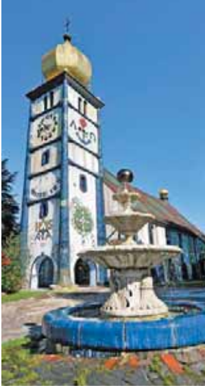
St. Barbara Church, Bärnbach

Knowledgeable Lecturers deepen your appreciation for the region and its history, culture and current events.