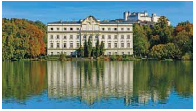
Leopoldskron Palace, one of the filming locations of "The Sound of Music"