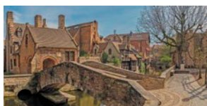
Old Town, Bruges