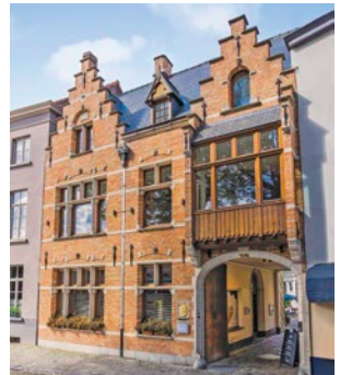
De Halve Maan Brewery, est. 1856, Bruges

Knowledgeable Lecturers deepen your appreciation for the region and its history, culture and current events.