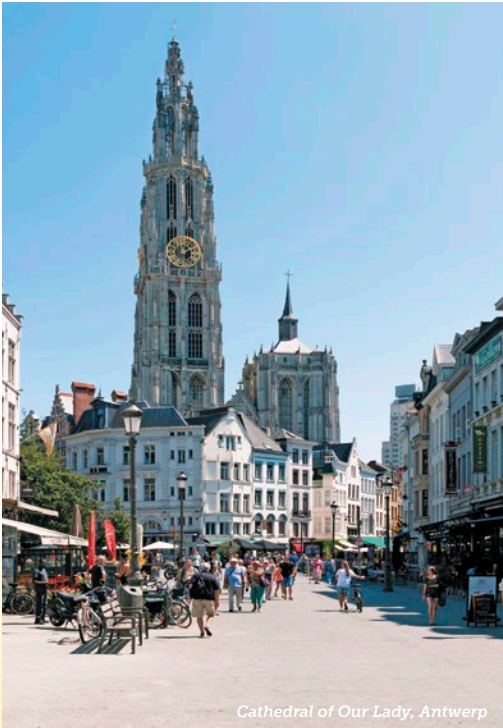
Cathedral of Our Lady, Antwerp

– 🌱 AHI Sustainability Promise: We strive to make a positive impact wherever we travel.