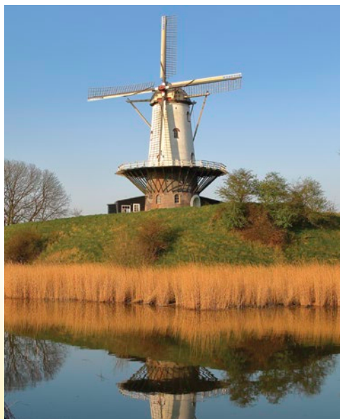
Windmill near Veere

After lunch on board, cruise this afternoon toward Enkhuizen on the banks of the IJssel.