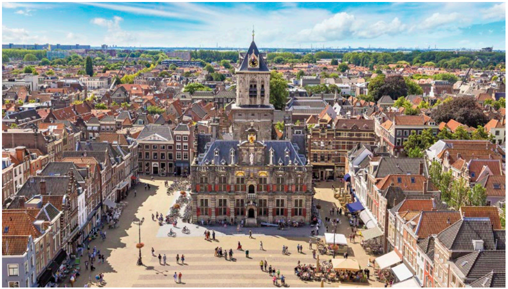
Old Town, Delft