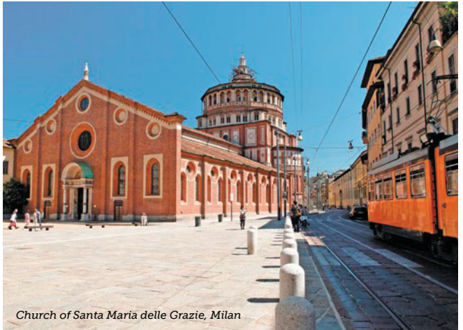
Church of Santa Maria delle Grazie, Milan