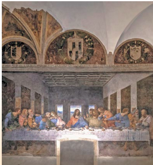
Leonardo da Vinci's "The Last Supper"