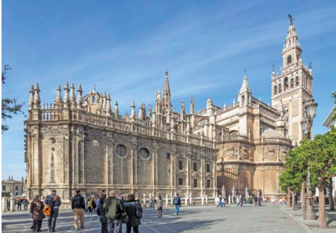
Cathedral of Sevilla