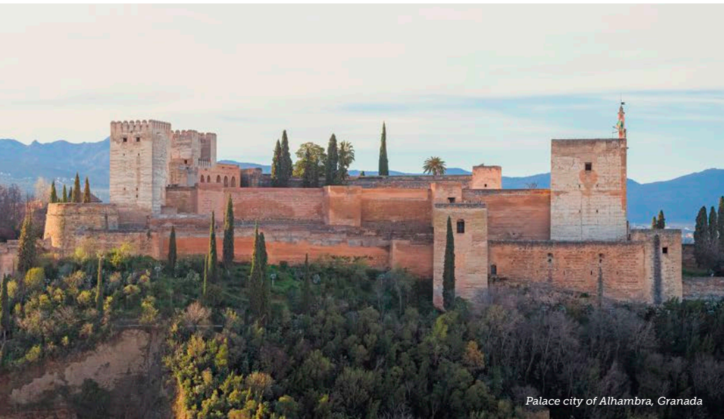
Palace city of Alhambra, Granada

Finish with a walk through the scenic Barrio de Santa Cruz and savor lunch on your own. Gather for dinner tonight at the parador.