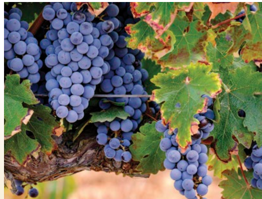
Vineyard near Ronda

Flamenco Performance. This evening, relish dinner at a local restaurant in Antequera while delighting in a special flamenco performance.