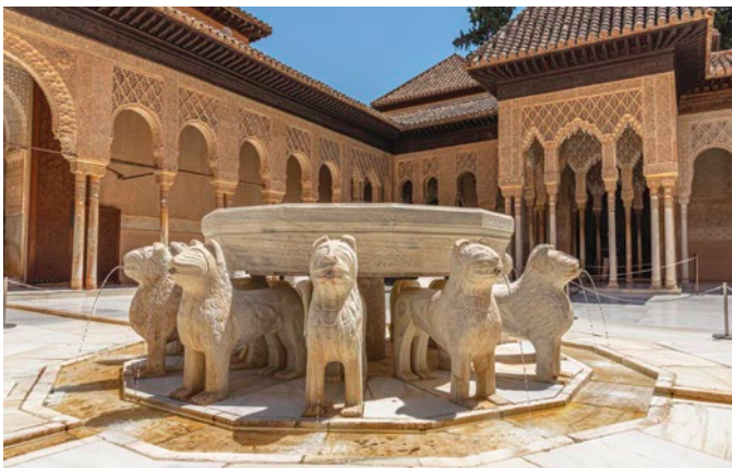
Patio of the Lions, Alhambra, Granada