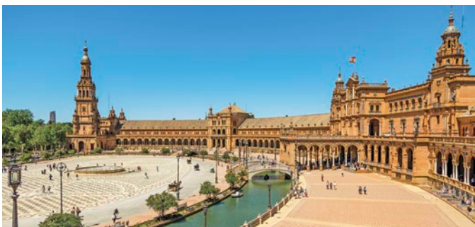
Plaza de España, Sevilla