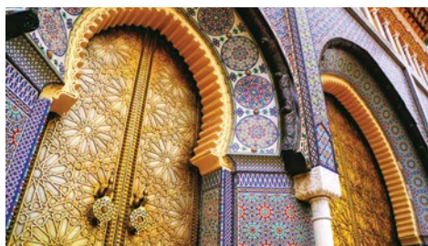
Top: Souk market, Marrakech | Above: Royal Palace, Rabat