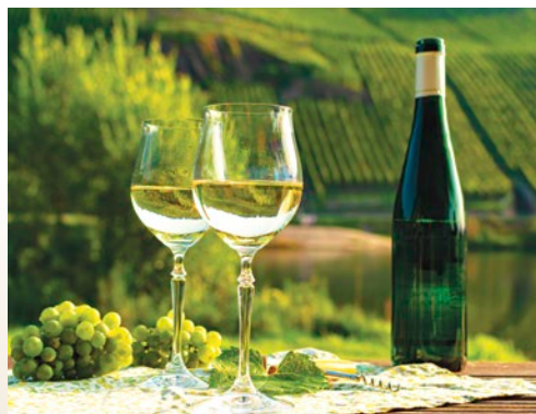
Below: Local Moselle wine | Right: Old Town, Würzburg

to see its centerpiece, the statue of Neptune. Continue towards the Obere Brücke and wander under the grand rococo archway to marvel at the red-roofed fishermen's houses and baroque mansions of Bamberg.