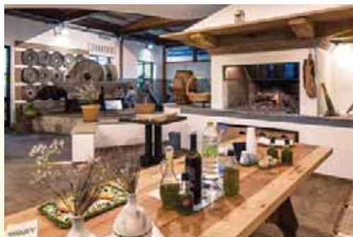
Oleoteca Bartolomei Olive Mill

A Day in Tuscany. Begin in the Etruscan city of Cortona, taking a guided walk past historic