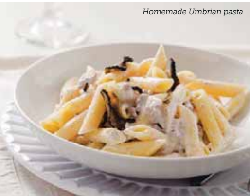
Homemade Umbrian pasta

Free Time: The remainder of the day and evening are yours to explore at leisure.