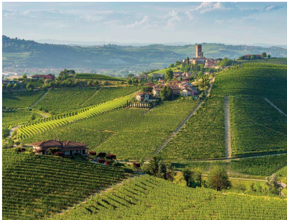
Langhe region, Piedmont

Italian Riviera. Set off to savor the dazzling, hilly Ligurian coastline dotted with vibrant harbor towns and bobbing boats. Take a guided walk in scenic, easygoing Santa Margherita, then cruise to chic Portofino tucked in a cove. After free time there, enjoy lunch on your own in Santa Margherita.