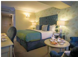
Old Ground Hotel | Ennis