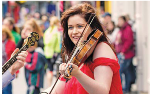
Top: Kylemore Abbey | Above: Musician

Aran Island of Inishmore. Ferry across Galway Bay to the largest of the Aran Islands. As you travel on a minibus, your local guide will share entertaining stories about life on this stark, arresting island, where Gaelic is the first language. See cliffside Dun Aengus, the most famous of the Aran Islands' Bronze Age forts, and pause for lunch before your return ferry.