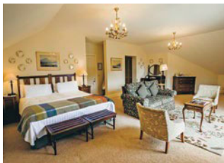
Rathmullan House | Rathmullan