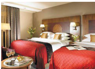
Westport Plaza Hotel | Westport