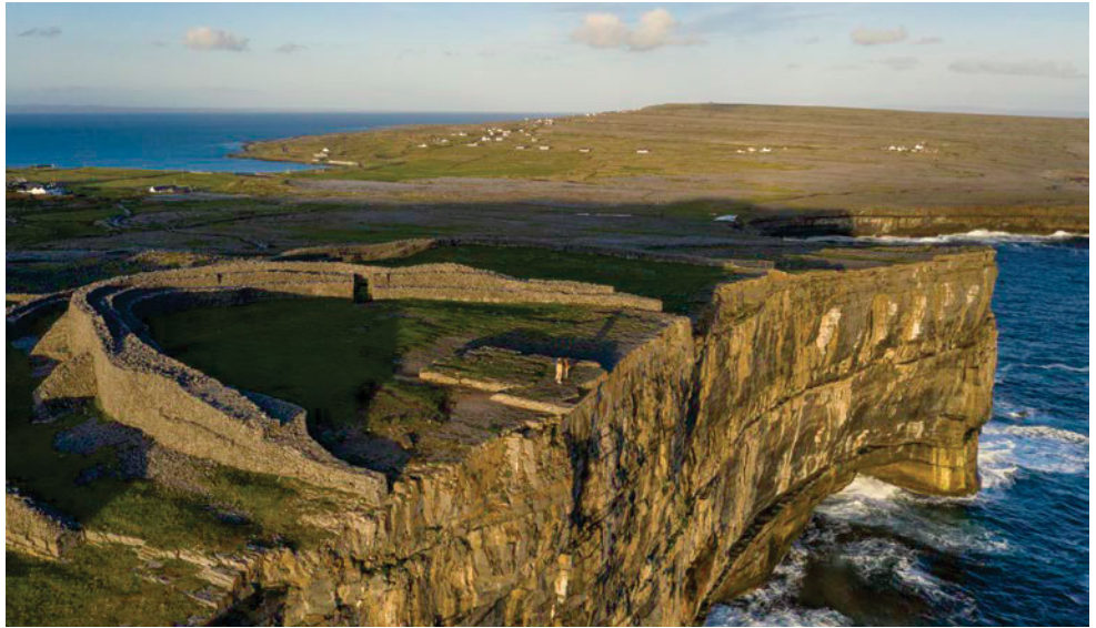
Dun Aengus, Inishmore