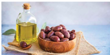
Top: Parthenon | Above: Olive oil & Kalamata olives