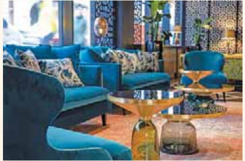
Hotel U14 | Helsinki