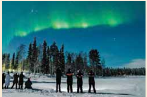
Northern Lights Village | Pyhä