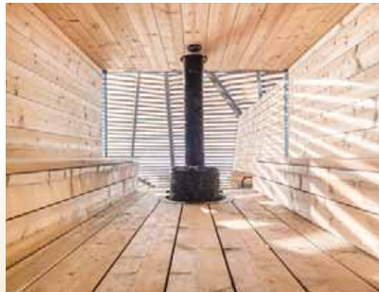
Löyly Sauna, Helsinki

Arktikum. This engaging science center and history museum in Rovaniemi reveals unique aspects of life in the Arctic. On a guided tour, view fascinating exhibits about the culture, history, wildlife and natural environment of northern Lapland.