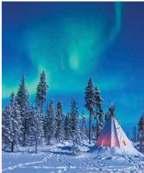
Warming hut at Aurora Camp