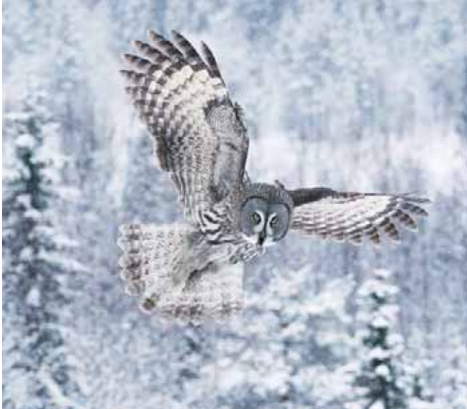
Great Grey Owl, Lapland