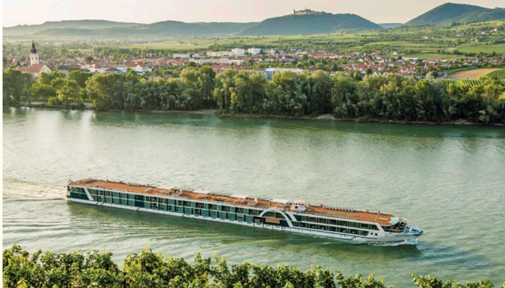
MS Amadeus Queen