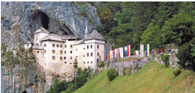
Predjama Castle, Slovenia