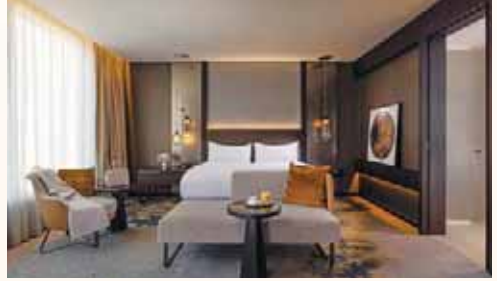
InterContinental Ljubljana | Ljubljana