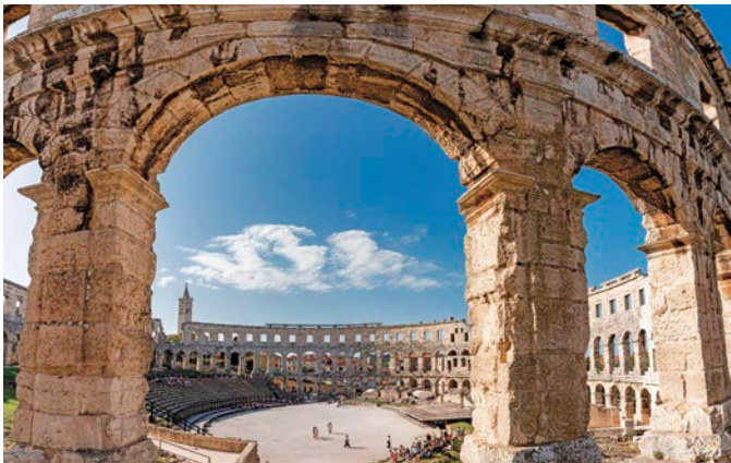
Roman amphitheater, Pula