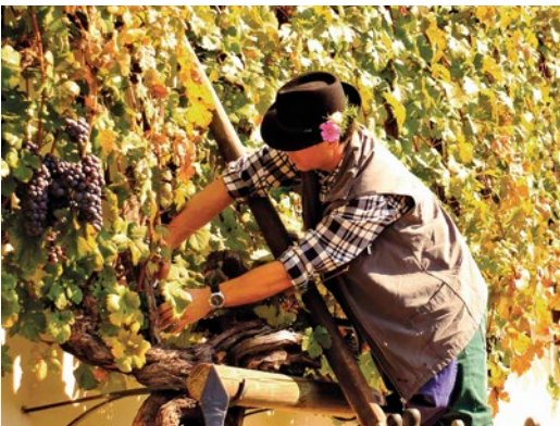
The Old Vine, Maribor

Dinner is on your own this evening. Istrian cuisine is flavorful and fresh.