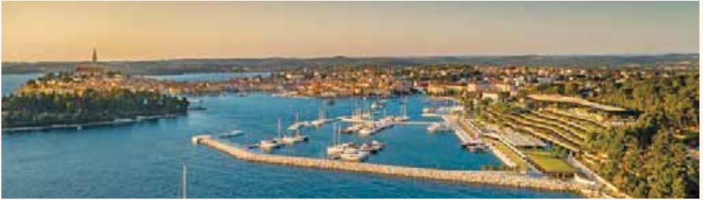
Grand Park Hotel Rovinj | Rovinj