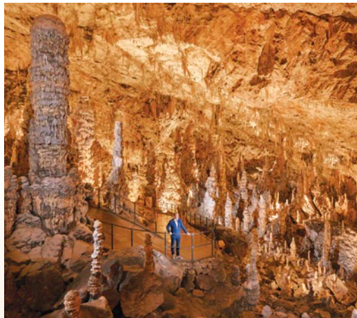
Postojna Cave, Slovenia

Pula & Rovinj. Explore two beloved towns of Istria today, beginning at the coastal city of Pula. Enter Pula's well-preserved Roman theater, the sixth largest of its kind. Stroll through a farmer's market where locals sell fresh fruit, souvenirs, sachets of lavender and truffle products. After an included lunch, head back to romantic Rovinj. The town's small harbor is filled with colorful fishing vessels and flat-bottomed batana boats. Walk through the endearing old town, passing rainbow-hued buildings, Venetian architecture, twisting narrow streets and the Church of St. Euphemia, Istria's largest baroque church.