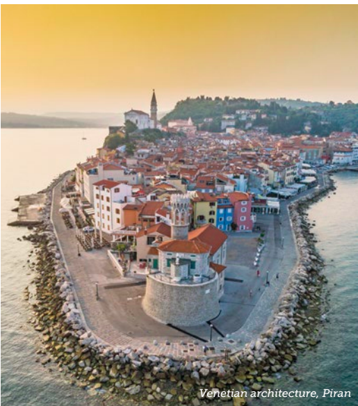
Venetian architecture, Piran