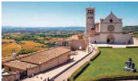
Basilica of San Francesco, Assisi

P.S. This program is open to all alumni and friends of UW – Madison. Traveling with the Wisconsin Alumni Association® (WAA) is now a member benefit, so although anyone - UW – Madison graduate or not - is welcome to explore the world with Badger travelers, at least one person in your party must be a WAA member to participate in a WAA tour. Membership information is available at uwalumni.com/membership .