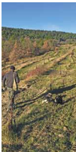
Hunting for truffles, Truffle farm, Les Pastras

Knowledgeable Lecturers deepen your appreciation for the region and its history, culture and current events.