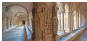
Saint Trophime Cathedral, Arles