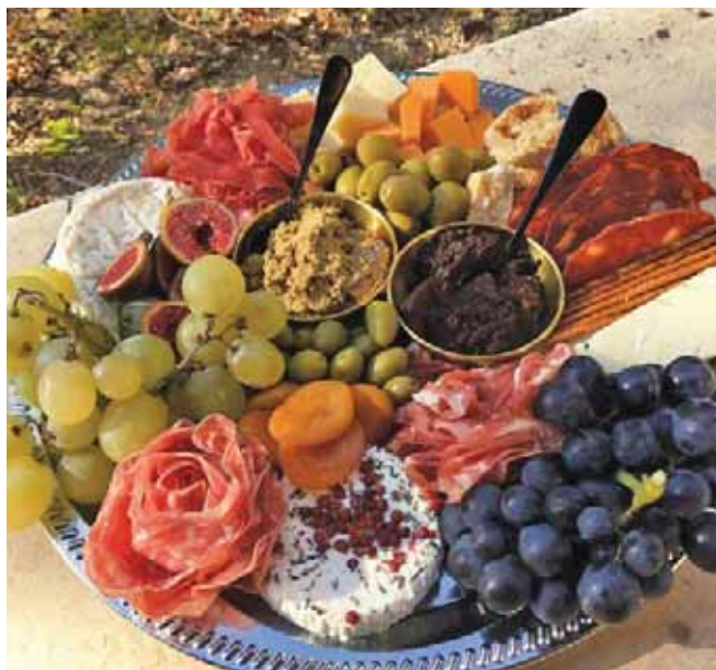
Fresh truffle hors d'oeuvres, Les Pastras