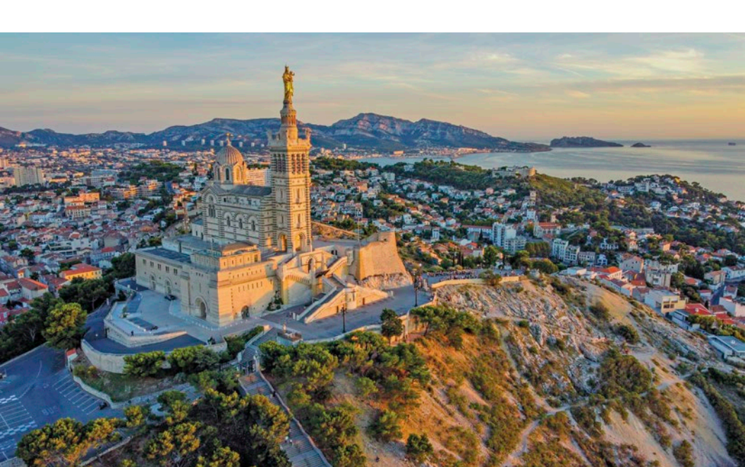
Notre-Dame de la Garde, Marseille