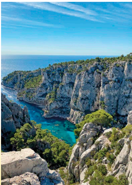
Calanques of Cassis