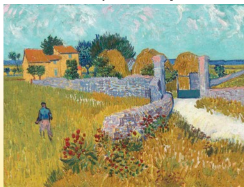
Farmhouse in Provence by Vincent van Gogh, 1888

Les Baux & St. Remy. Delight in visits to two quintessentially Provençal villages. Les Baux, perched atop towering limestone cliffs, offers breathtaking views, a tiny medieval village and ancient fortress. In romantic St. Remy’s, gaze at the lush, perfumed valleys that inspired more than 150 of Van Gogh’s paintings during one of his most artistically fruitful periods. Return to Aix for a festive group dinner tonight.