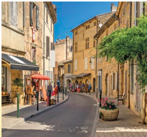
Charming Lourmarin, Luberon

Enrichment. Splendors of Aix-en-Provence & the South of France.