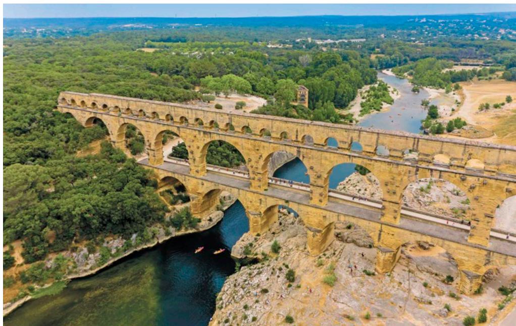
Pont du Gard