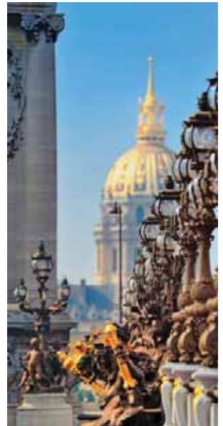
Pont Alexandre III

Knowledgeable Lecturers deepen your appreciation for the region and its history, culture and current events.