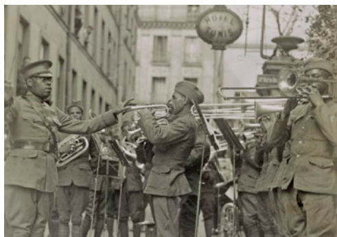
369th Infantry Regiment

Your next adventure begins in chic Paris! This unique program reveals the critical role that the French capital played in African American history. From the banks of the Seine River to storied landmarks and beyond, follow in the footsteps of prominent Black musicians, writers and luminaries and understand how African Americans helped shape the identity of this magical city!