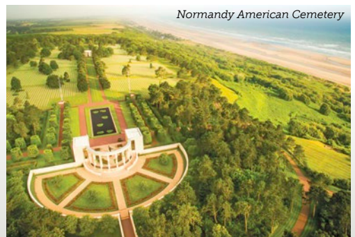
Normandy American Cemetery

Then, in Colleville-sur-Mer, pay a poignant visit to the Normandy American Cemetery. Set on a beautiful bluff overlooking Omaha Beach, the cemetery contains 9,385 graves of Americans who died in the invasion and subsequent battles, as well as a tranquil memorial garden honoring those missing in action.