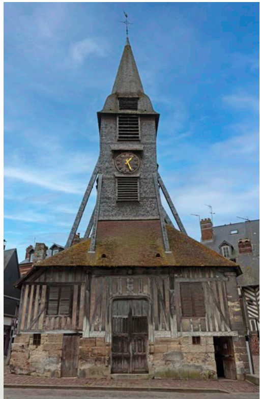
Church of Sainte Catherine, crafted by 15th-century shipbuilders