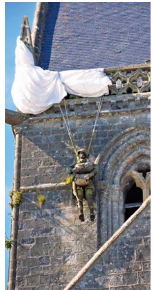
Private John Steele Monument, Sainte-Mère-Église

Knowledgeable Lecturers deepen your appreciation for the region and its history, culture and current events.