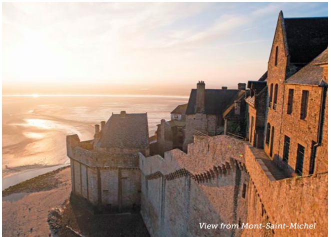
View from Mont-Saint-Michel