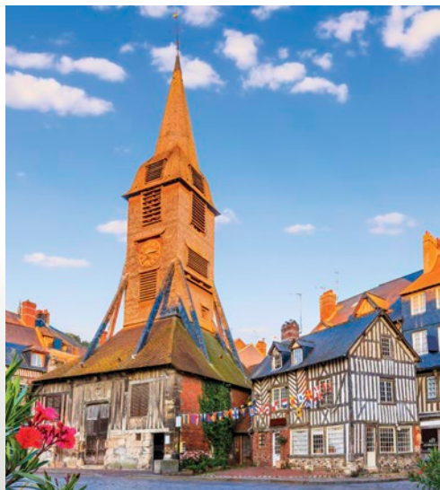
Church of Sainte Catherine, Honfleur

Free Time: Select a special place for dinner. Your Travel Director can assist with planning.