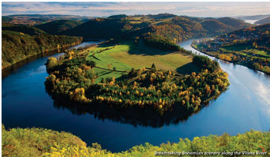
Breathtaking Bohemian scenery along the Vltava River