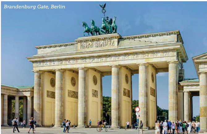
Brandenburg Gate, Berlin