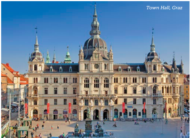
Town Hall, Graz