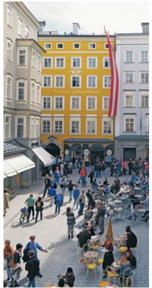
Mozart's Birthplace, Salzburg