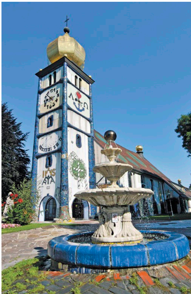
St. Barbara Church, Bärnbach