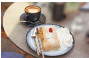
Apple strudel, Graz