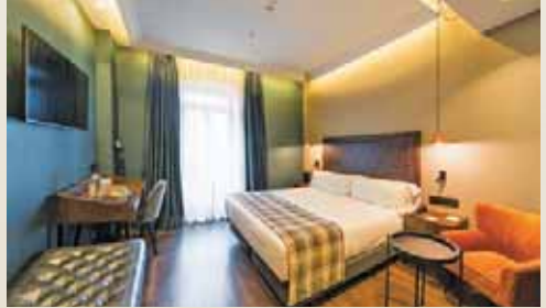
Catalonia Donosti Hotel | San Sebastián