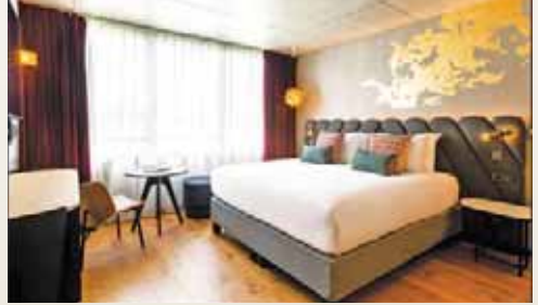
Renaissance Bordeaux Hotel | Bordeaux