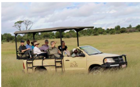
Top: Lion | Above: Safari