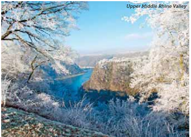
Upper Middle Rhine Valley