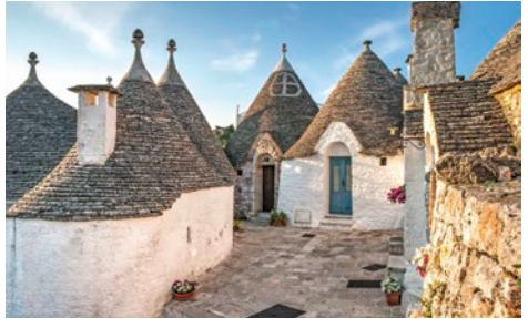
Top: Polignano a Mare | Above: Trullo