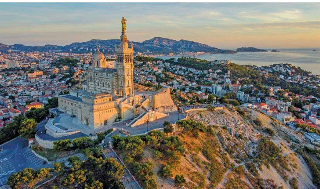
Notre Dame de la Garde, Marseille