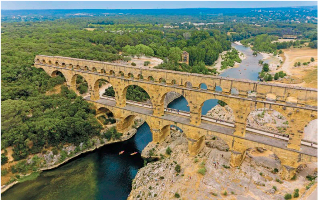
Pont du Gard