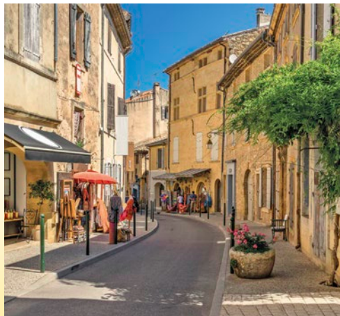
Charming Lourmarin, Luberon

Enrichment. Splendors of Aix-en-Provence & the South of France.