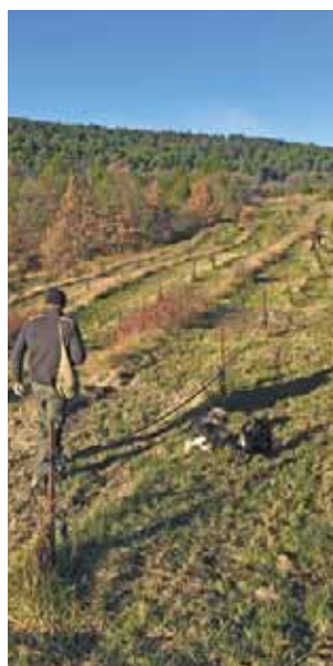
Hunting for truffles, Truffle farm, Les Pastras

Knowledgeable Lecturers deepen your appreciation for the region and its history, culture and current events.