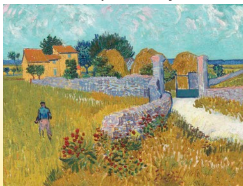
Farmhouse in Provence by Vincent van Gogh, 1888

Join a festive group dinner in town tonight.