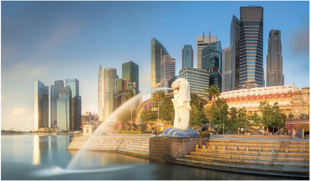
Merlion Park, Singapore