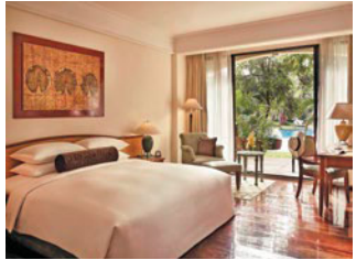
Sofitel Angkor Phokeethra Golf & Spa Resort | Siem Reap, Cambodia