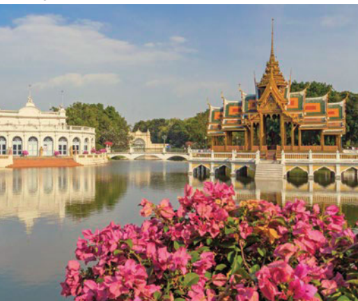
Bang Pa-In Palace

🔄 Elective | Sala Rim Naam. Join an evening immersed in Thai culture to experience a Thai dance show and a dinner of classic dishes.