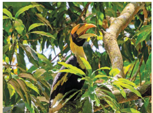
Great hornbill, Taman Negara National Park