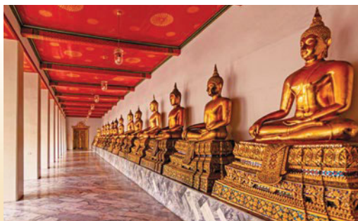
Emerald Buddha Temple, Bangkok

AHI Connects | Local Life. Engage with a Cambodian family while making rice noodles.