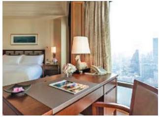
The Peninsula Bangkok | Bangkok, Thailand