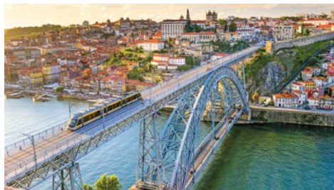
Top: Douro Valley | Above: Porto