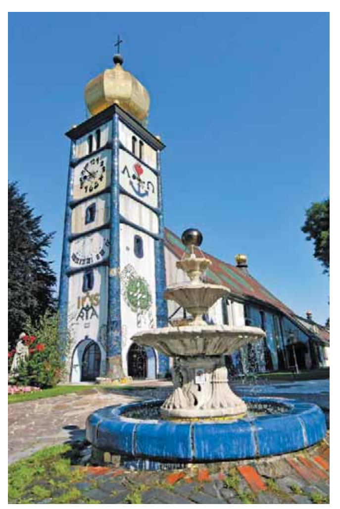
St. Barbara Church, Bärnbach