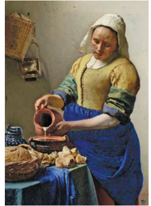
Detail of "The Milkmaid," Johannes Vermeer, Rijksmuseum