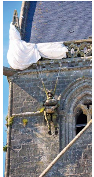
Private John Steele Monument, Sainte-Mère-Église

Knowledgeable Lecturers deepen your appreciation for the region and its history, culture and current events.