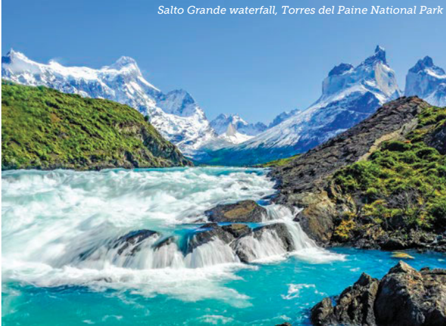
Salto Grande waterfall, Torres del Paine National Park