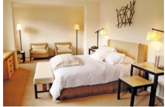
Enjoy Puerto Varas Hotel | Puerto Varas