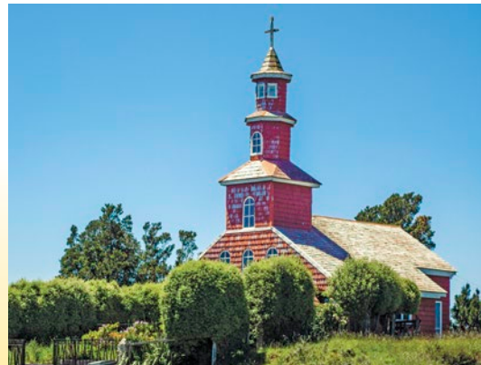
Wooden church, Chacao, Chiloé Island

Petrohué River Falls. Breathtaking scenery is the star attraction today within Vicente Pérez Rosales National Park. Admire the rushing, turquoise waters of the falls and then navigate by boat through stunning Lake Todos los Santos surrounded by the impressive, snowcapped Osorno, Puntagudo and Tronador volcanoes.