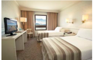
Hotel Costaustralis | Puerto Natales