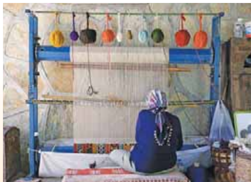
Traditional rug weaving, Etrim