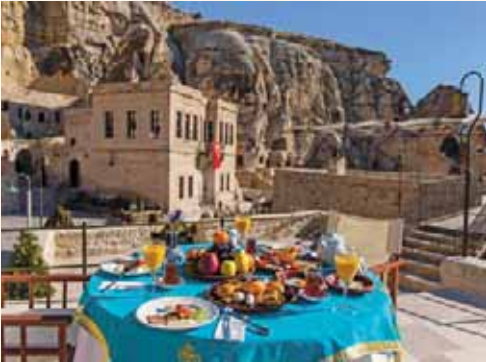
Yunak Evleri Cave Hotel | Ürgüp (Cappadocia)