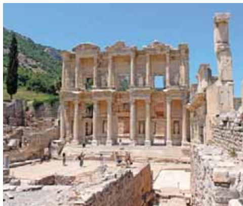
Library of Celsus, Ephesus