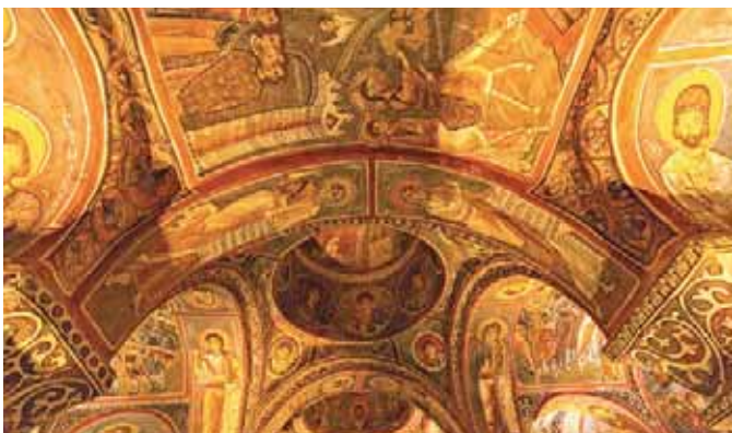
Beautifully preserved frescoes in the Dark Church, Göreme National Park