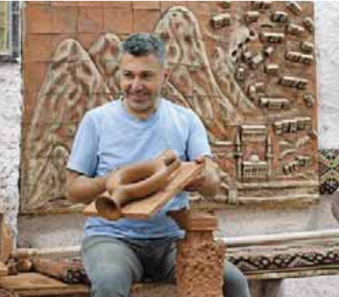
Pottery demonstration, Avanos

After lunch with your group, continue to Bodrum and embark the gulet. Savor dinner later on board.