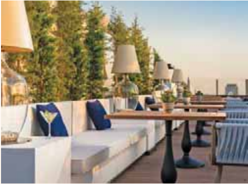
Barceló Istanbul Hotel | Istanbul