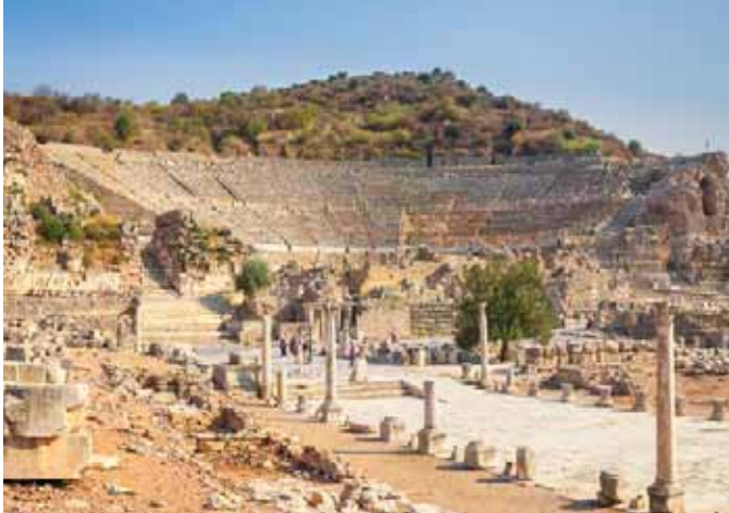
Great Theater of Ephesus