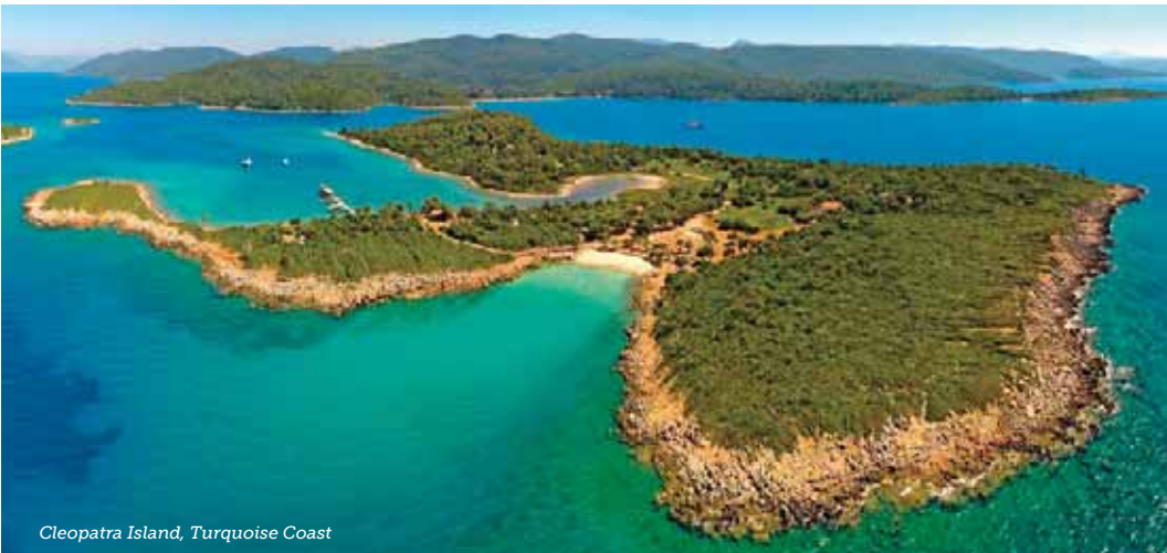
Cleopatra Island, Turquoise Coast

Devrent Valley. See formations that resemble animals and objects in this scenic region.