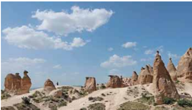
Devrent Valley, Cappadocia