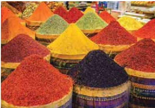
Above: Historic village of Cavusin, Cappadocia Right: Spice Bazaar, Istanbul

🌐 Elective | Cappadocia Hot Air Balloon Ride. Float over the incredible, multicolored terrain on an unforgettable sunrise journey.