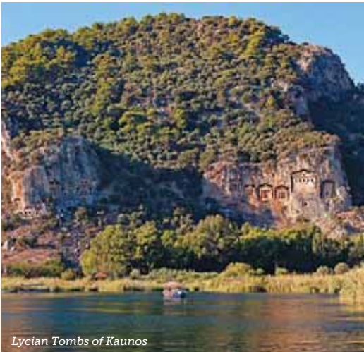
Lycian Tombs of Kaunos

Tonight, join your fellow travelers for a Farewell Reception and Dinner on the yacht.