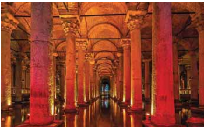
Basilica Cistern, Istanbul