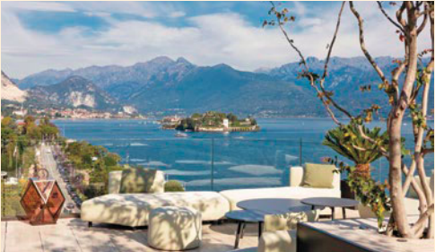
Hotel La Palma | Stresa