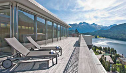
Hotel Schweizerhof | St. Moritz