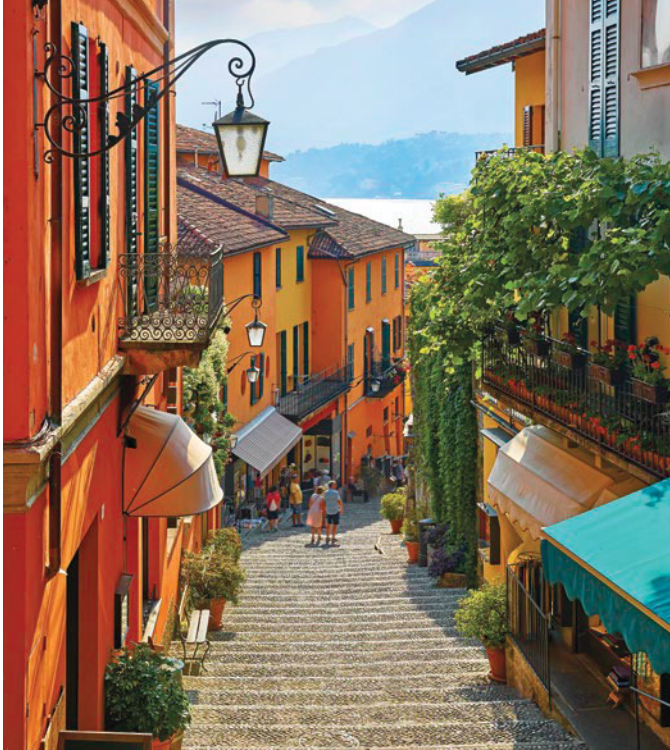
Bellagio, The Pearl of Lake Como