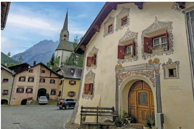
Traditional Engadine houses, Zuoz