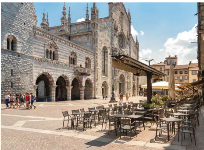
Duomo Square, Como