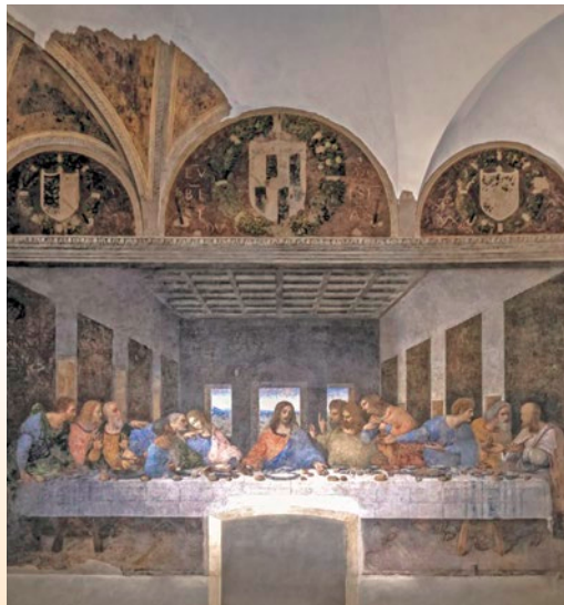
Leonardo da Vinci's "The Last Supper"