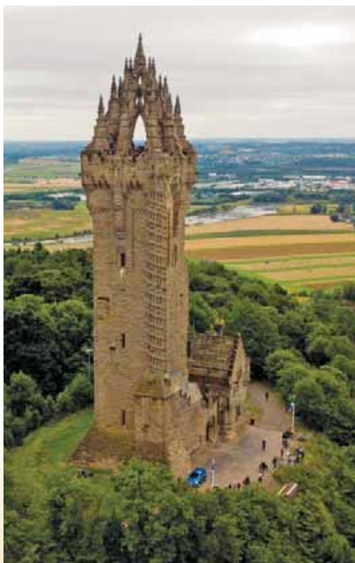
National Wallace Monument