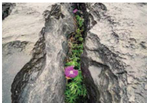
Flora among the limestone, Burren