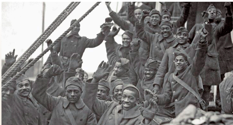
369th Infantry Regiment