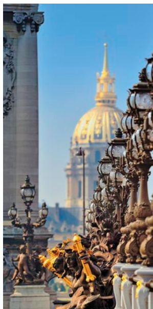
Pont Alexandre III

Knowledgeable Lecturers deepen your appreciation for the region and its history, culture and current events.