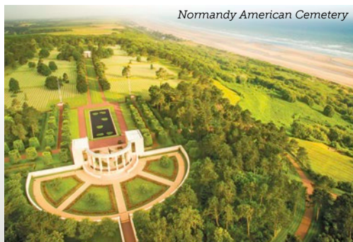
Normandy American Cemetery

Then, in Colleville-sur-Mer, pay a poignant visit to the Normandy American Cemetery. Set on a beautiful bluff overlooking Omaha Beach, the cemetery contains 9,385 graves of Americans who died in the invasion and subsequent battles, as well as a tranquil memorial garden honoring those missing in action.