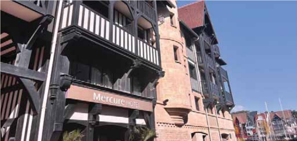
Hôtel Mercure Deauville Centre | Deauville