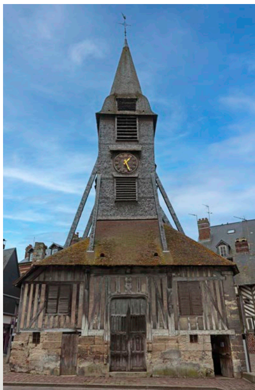
Church of Sainte Catherine, crafted by 15th-century shipbuilders