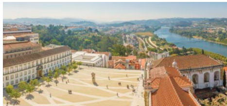
University of Coimbra