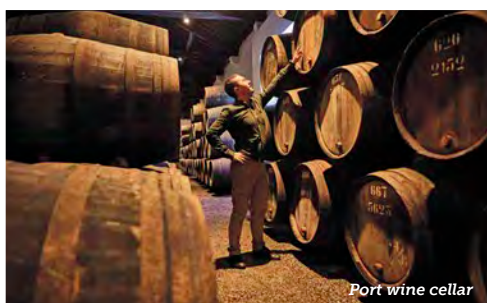
Port wine cellar

Continue to a port wine cellar for a wine tasting. (Active)