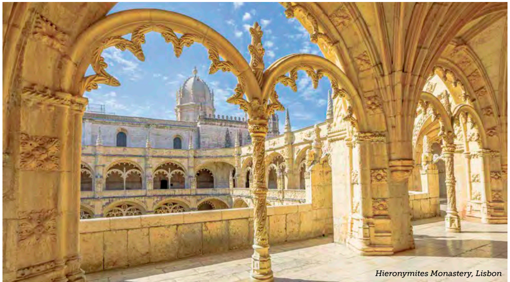
Hieronymites Monastery, Lisbon