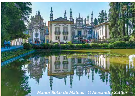
Manor Solar de Mateus