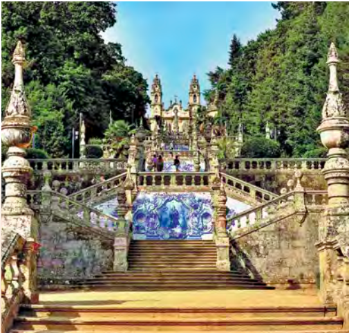
Nossa Senhora dos Remédios, Lamego