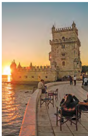
Belém Tower, Lisbon