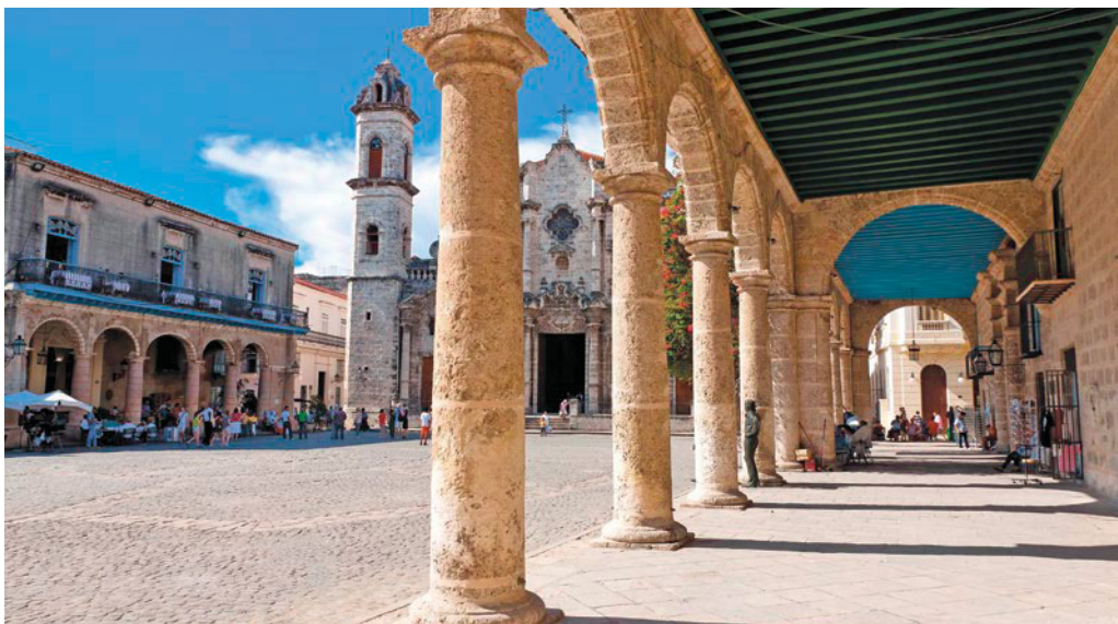
Plaza of the Cathedral, Old Havana