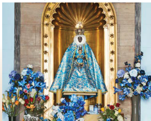
Black Madonna, Iglesia de Nuestra Señora de Regla

Take a break while enjoying a small chamber orchestra performance and lunch. Then, visit the Sugar Mill Triunvirato museum and see the moving Monument to the Slaves' Rebellion.