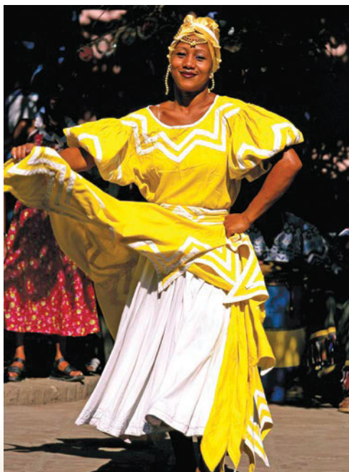
Top: Vintage automobiles, Havana Cover: Cuban jazz musician Mail panel: Old Havana | Afro-Cuban musician