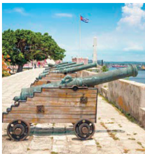
Cannons at fortification, Havana