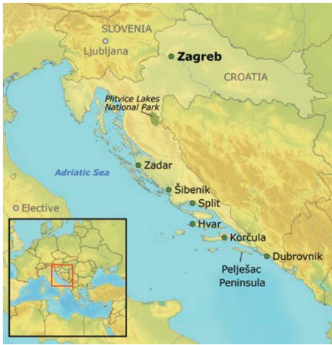
Plitvice Lakes National Park