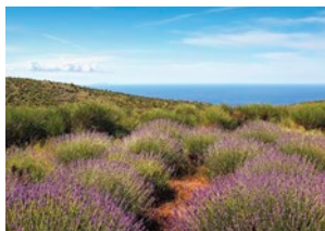
Lavender farm, Hvar