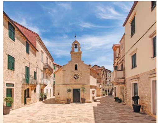
Stari Grad, Hvar

Vrboska & Winery. Learn about the local viticulture at a family winery and enjoy a guided tasting of the family's legendary wines. Continue to the fishing town of Vrboska with fig-covered courtyards and pretty alleyways.