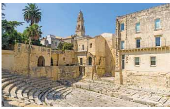
Ruins of a Roman amphitheater, Lecce