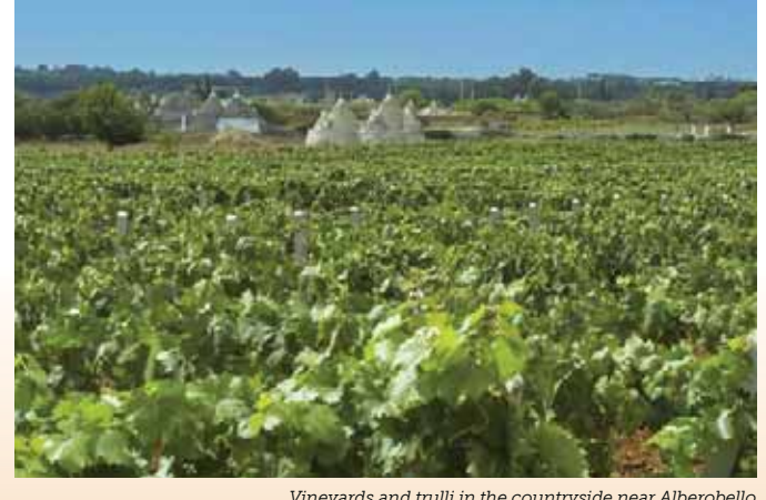
Vineyards and trulli in the countryside near Alberobello