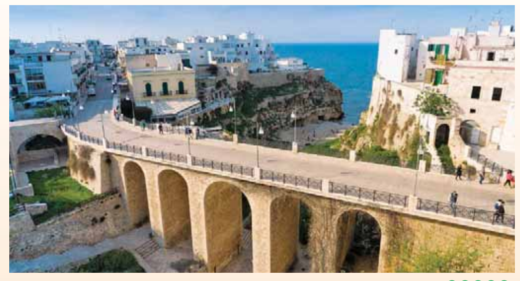
Hotel Covo dei Saraceni | Polignano a Mare