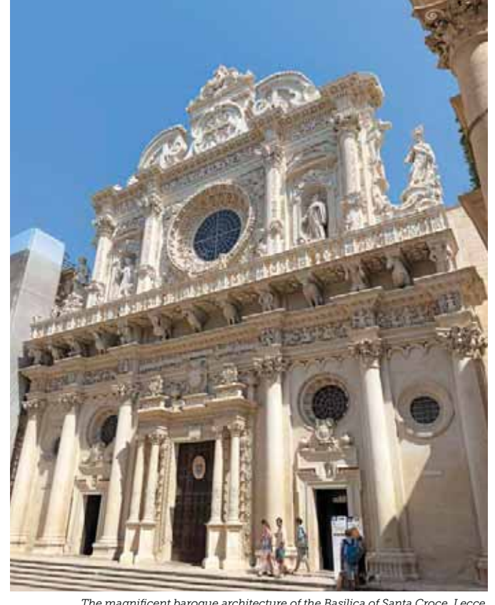
The magnificent baroque architecture of the Basilica of Santa Croce, Lecce