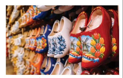
Top: Amsterdam | Above: Traditional wooden shoes